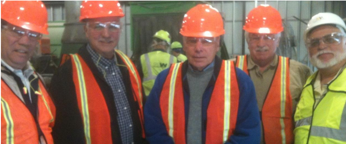
“Waiting to be recycled”