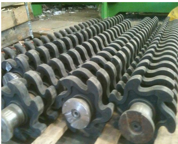
Rollers used in the separation. Made in Sweden