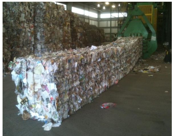
Paper being extruded out of the baler.