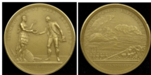
Images of front and back of medal

Did you know that Easttown Township is home to a Congressional Gold Medal recipient - Major General "Mad" Anthony Wayne? Awarded to military members and civilians, being granted this medal is one of the highest civilian awards in the United States; only seven were issued during the American Revolution. Nearly 250 years later, only 173 medals have been awarded. While the original medal is stored in the Philadelphia Mint, two copies are on display at Historic Waynesborough, so guests can see the front and back.