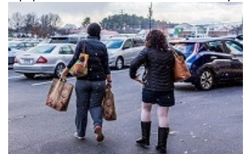
National Safety Council ~ nsc.org

Large parking lots, such as those found at shopping malls, are considered most vulnerable to crime, according to the Urban Institute Justice Policy Center. One way for consumers to steer clear of trouble is to pick a lot where pedestrian traffic is restricted and video surveillance equipment is used to monitor the facility.