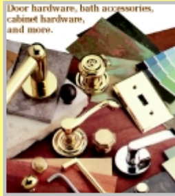
Door hardware, bath accessories, cabinet hardware, and more.

Serving Philadelphia, Montgomery, Delaware, Chester Counties since 2004