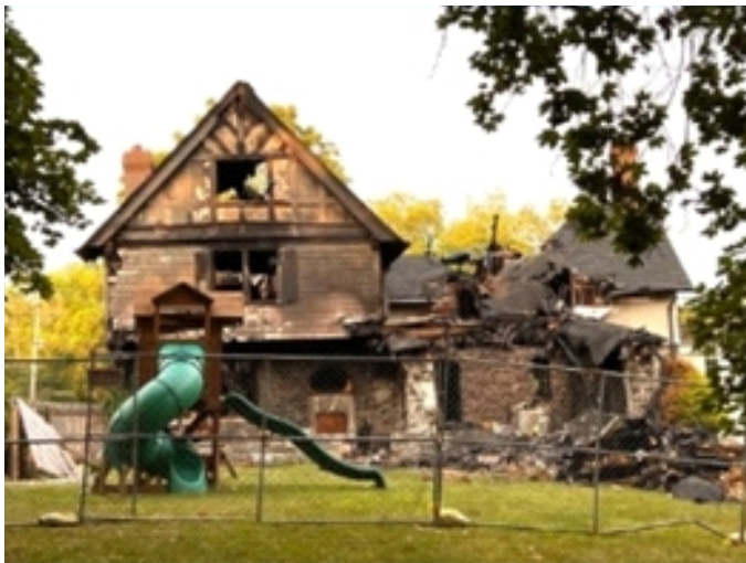
Rear yard facing East, 2024